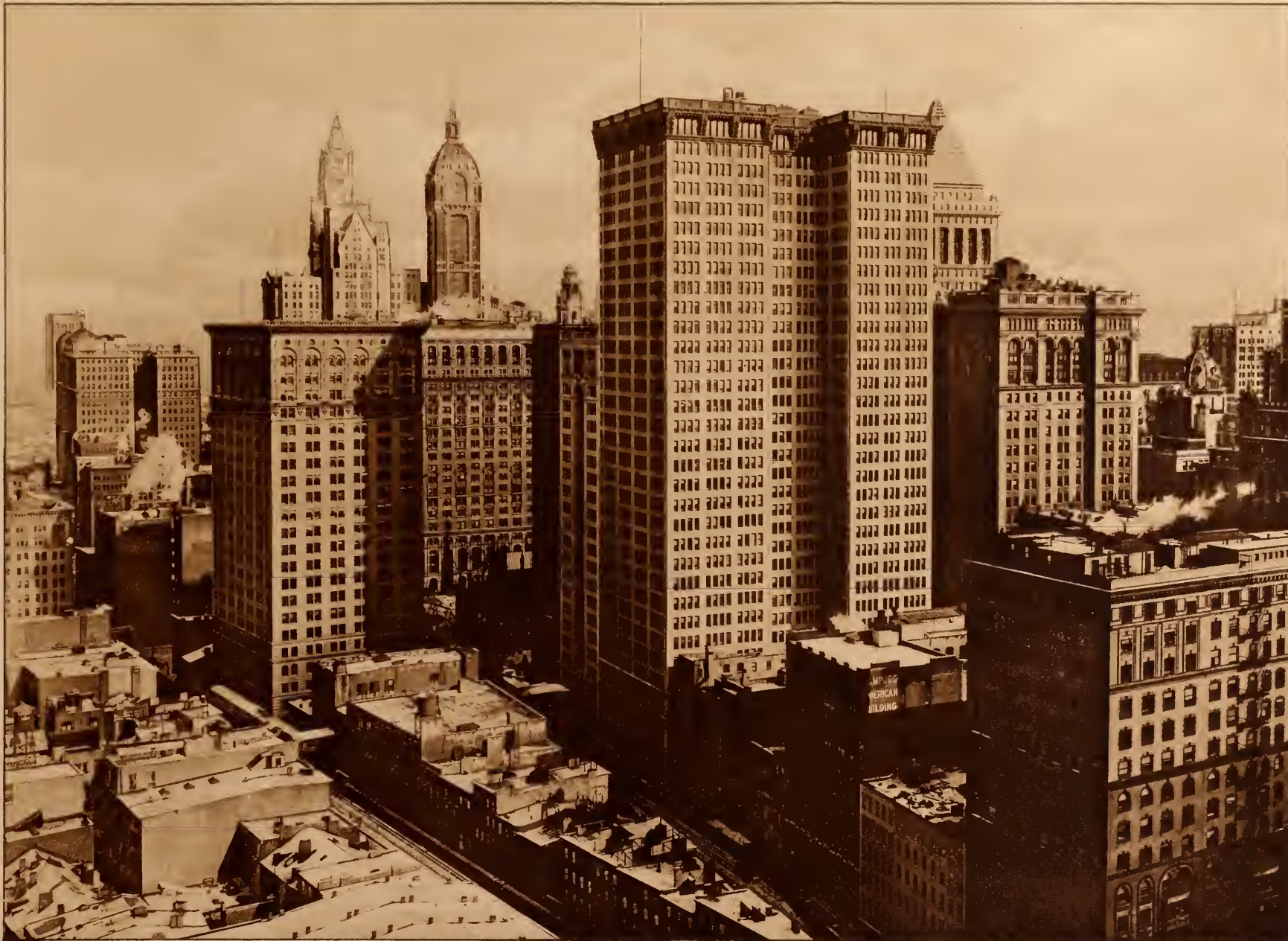
SKYLINE OF NEW YORK'S BUSY "DOWNTOWN" SECTION. The three towers from left to right are: Woolworth, Singer, Bankers Trust Buildings. The streets on which these buildings stand are full of historic landmarks, it being the oldest part of the city.